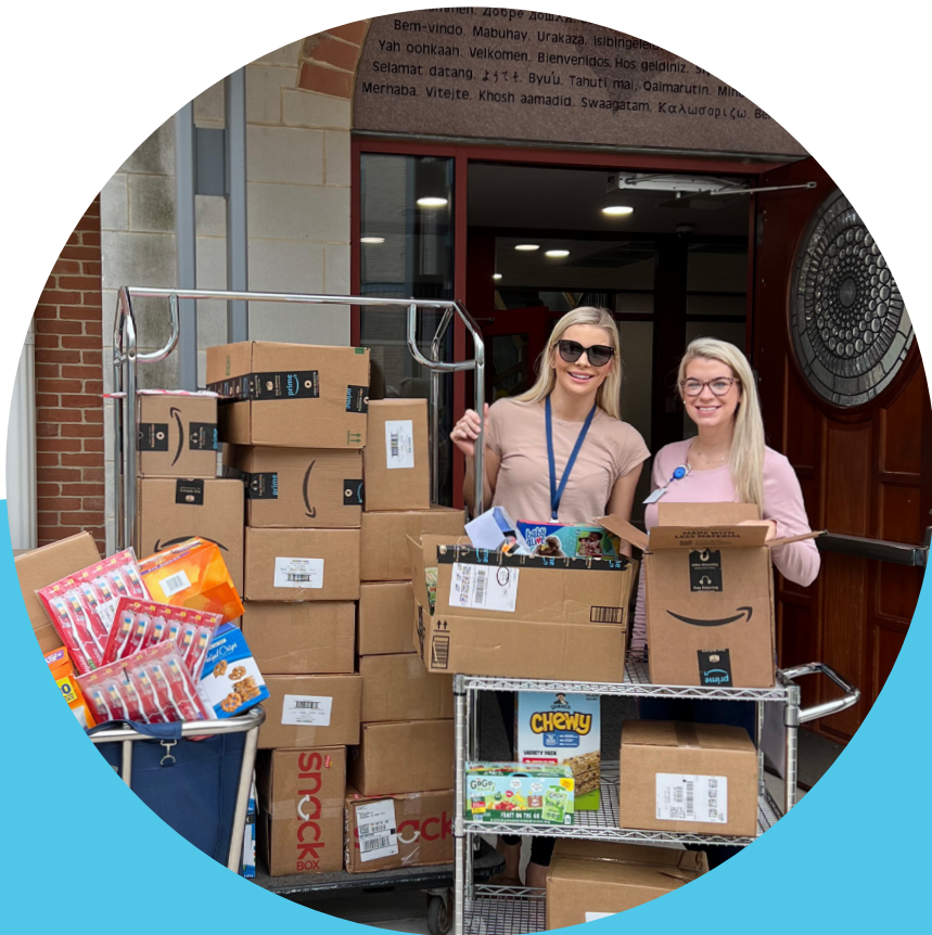
Two MassMutual Ascend employees delivering donations to the Ronald McDonald House .